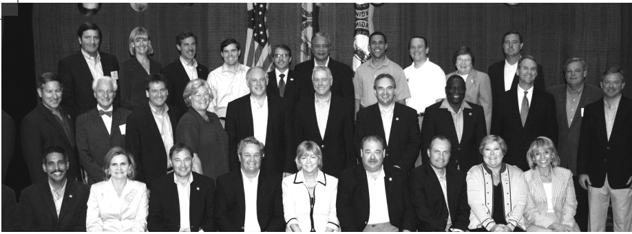
NLGA members at the Winter Meeting